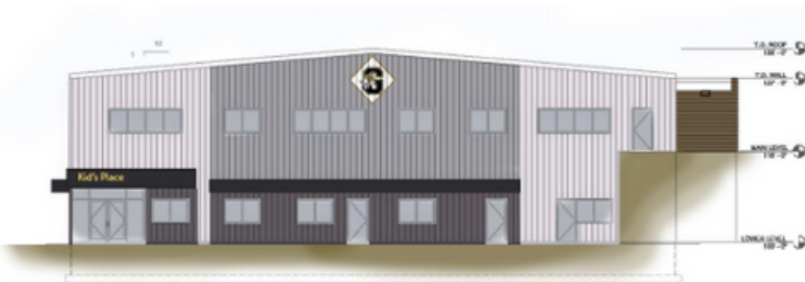
WEST ELEVATION 121'-0" x 117'-0"