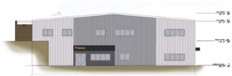
EAST ELEVATION 121'-0" x 117'-0"